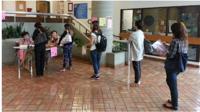
↑ Students checking in for orientation ↓

New international students participated in orientation on either August 28 or 29, depending on their programs. Students received information about people and resources available to them at VCC and in Vancouver. Topics included: cultural adjustment, important immigration documents, VCC services and support, staying safe and healthy, and Campus Tours were led by returning VCC international student volunteers.