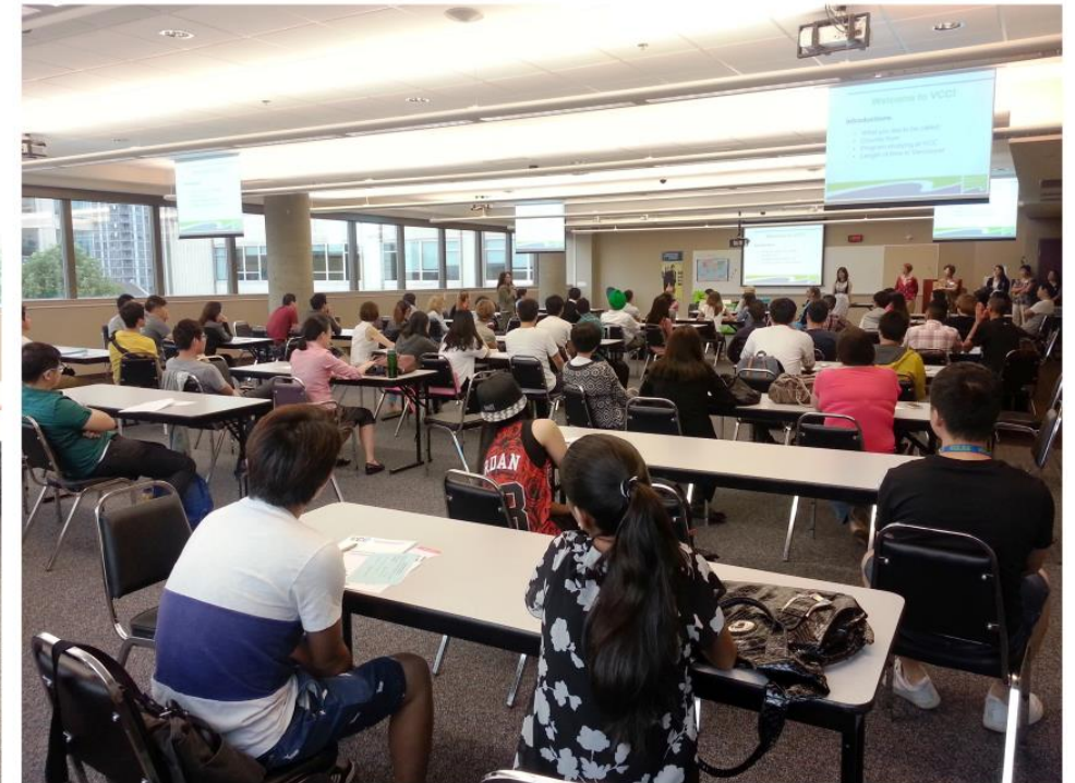
New Student Orientation for international students starting in the September 2014 term

At this fun and informative event, students had the opportunity to also make new friends and connect with other international students.